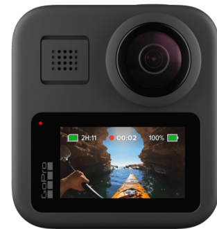
Figure 3: View of GoPro Max touchscreen/ https://gopro.com/