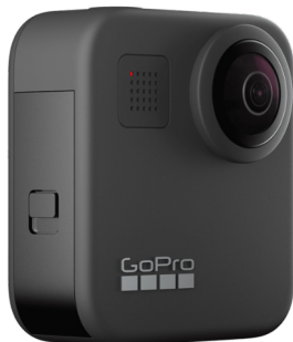
Figure 1: View of GoPro Max front/ https://gopro.com/

The GoPro Max functions similar to a standard camera for capturing videos and images. The notable difference is that it has two lenses (see fig. 1). To capture 360 content, users can toggle between standard and 360 videos by using the icon in the lower-left corner of the touchscreen (see fig. 2). Once the setting is selected, video can be captured by using the record button. Despite the simplicity of the process, the camera setup is pivotal. Any camera motion will cause users to become disoriented when capturing 360 videos for VR. It is essential to capture multiple scenes via cuts in the video instead of physically moving through space. Also, the position of the camera relative to the scene is essential. The circulating GoPro kits include small portable tripod approximately two feet high. These are mobile, but it is better to place the camera lens at head level. Doing so ensures any narrators do not tower over the VR viewers and reduces a viewer's sense of displacement due to height change. Finally, trim the video at the start and end of the footage. Trimming footage in the GoPro app is easy and will remove the awkwardness of moving away from the camera or interacting with a phone at the start and end of image capture.