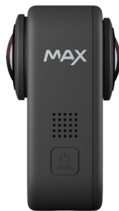
Figure 2: Side view of GoPro showing two lenses/ https://gopro.com/